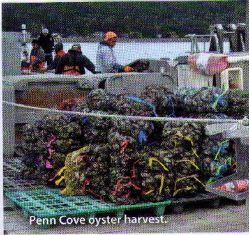
Penn Cove oyster harvest.