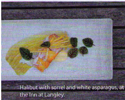
Halibut with sorrel and white asparagus, at the Inn at Langley.