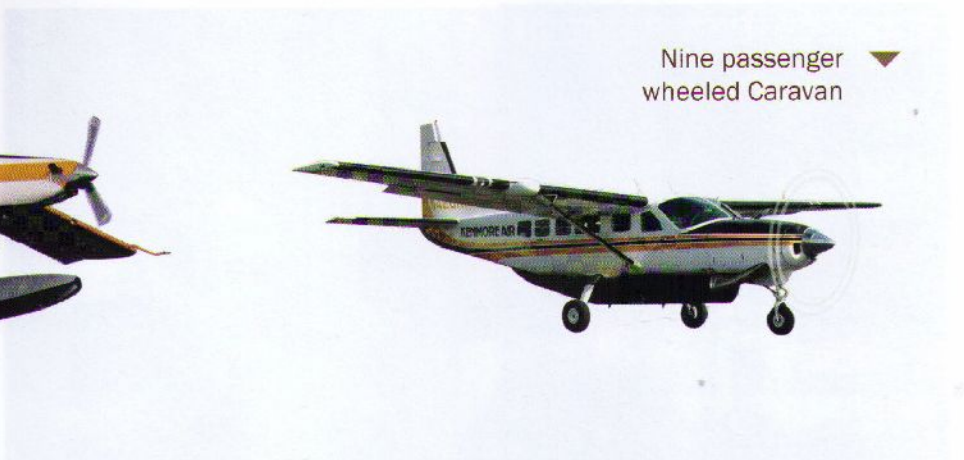
▼ Nine passenger wheeled Caravan