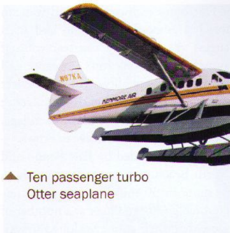
▲ Ten passenger turbo Otter seaplane